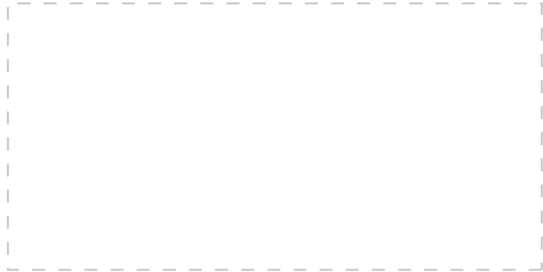
Actual Imprint Size mm W x mm H

Dotted line indicates maximum print area