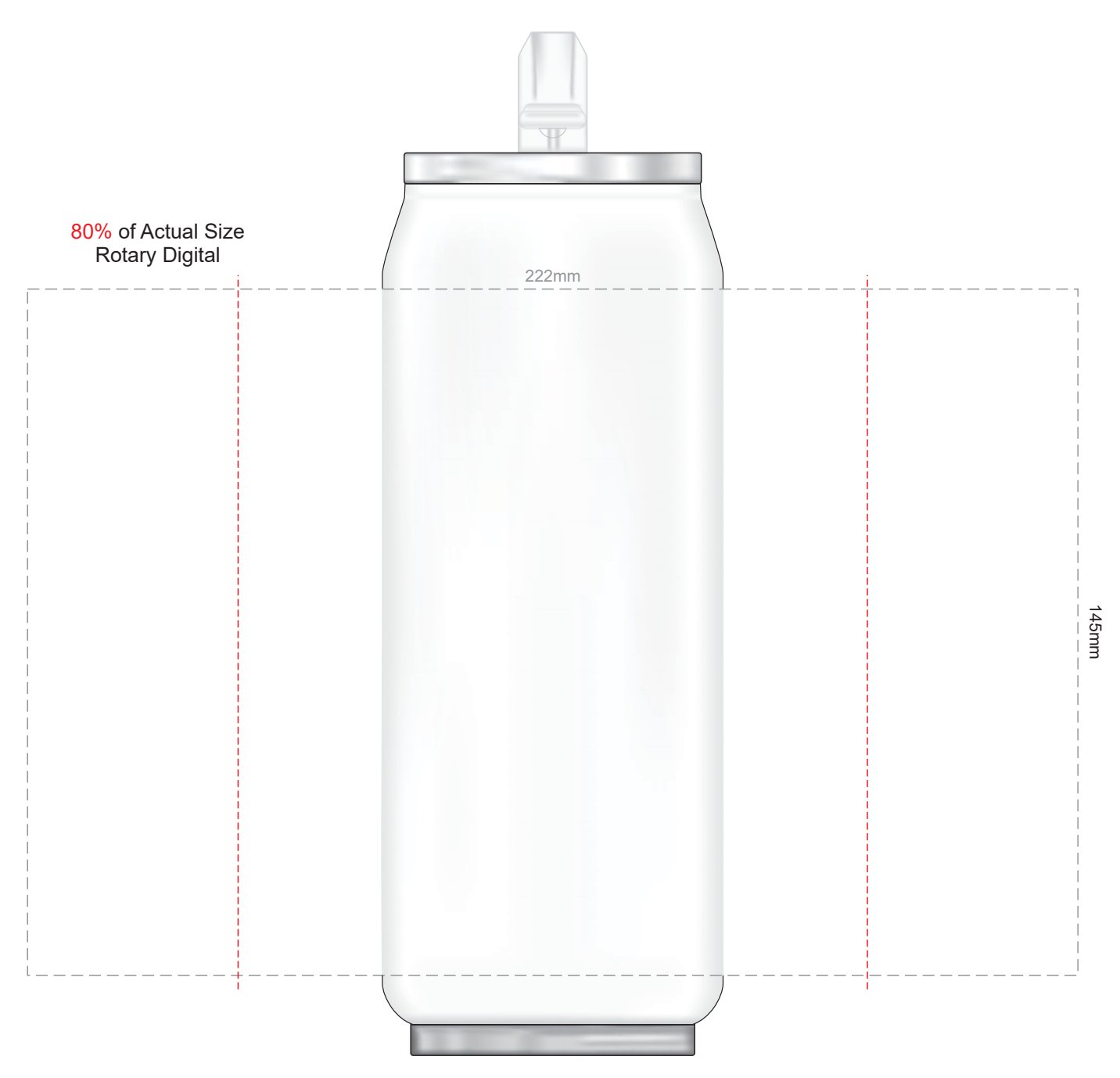
Red Line = Exact opposites of the product (centre artwork to the red line)