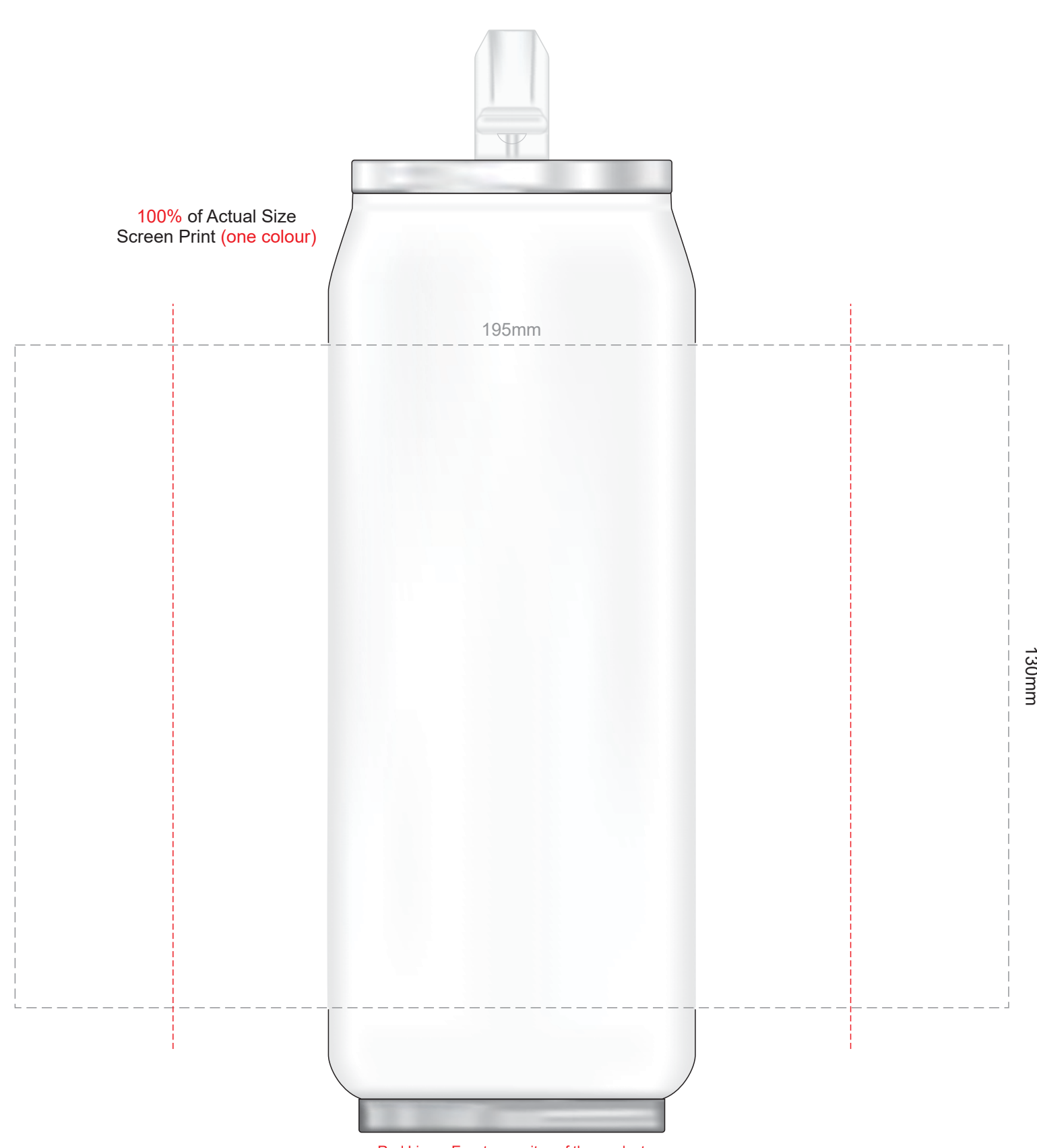
Red Line = Exact opposites of the product (centre artwork to the red line)