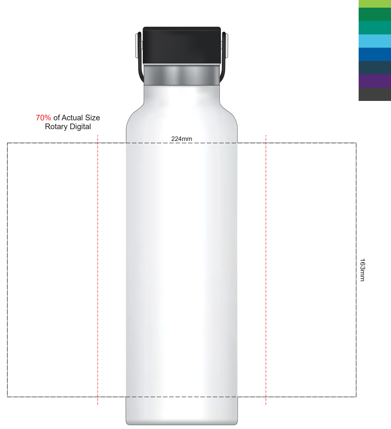
Red Line = Exact opposites of the product (centre artwork to the red line)