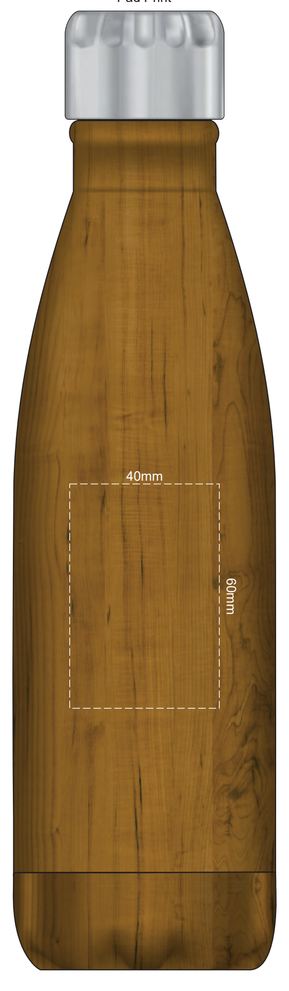
100% of Actual Size Pad Print