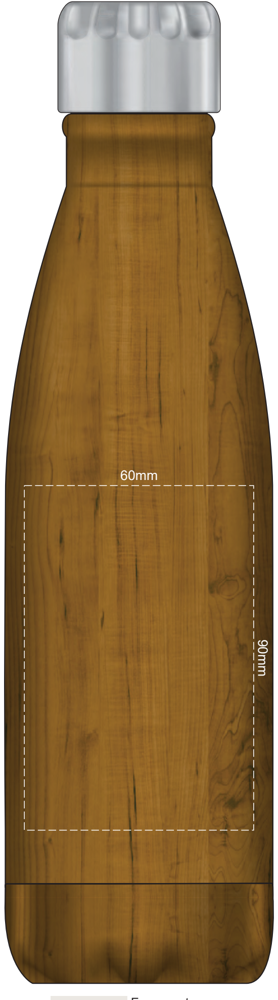
Engraves to a Shiny Steel Finish